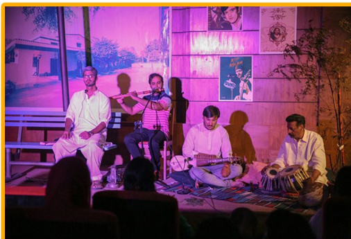
Theatre Play (Adhoori Kahaani) by Students of BCA

For Contact Foundation University Rawalpindi Campus New Lalazar, Rawalpindi, Pakistan.