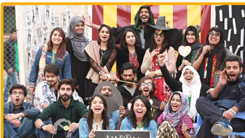
Photo booth Activity by Students of BCA